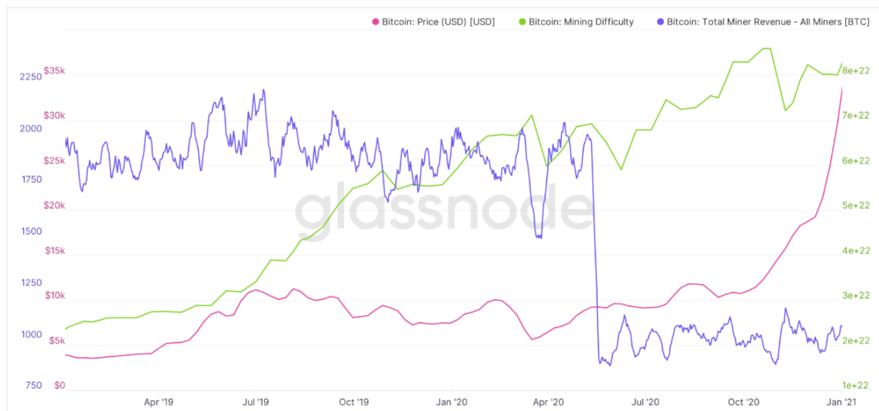
Bitcoin: Price (USD) vs. Bitcoin: Mining Difficulty vs. Bitcoin: Total Miner Revenue - All Miners

For your reference is a Bitcoin price vs Bitcoin miners' revenues (in Bitcoin block rewards and transaction fees) vs block difficulty* chart for the 24-month period from January 2019 to January 2021: