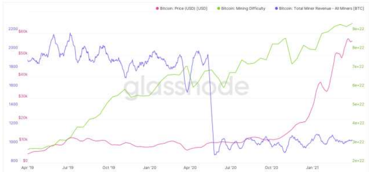
Bitcoin: Price (USD) vs. Bitcoin: Mining Difficulty vs. Bitcoin: Total Miner Revenue - All Miners

For your reference is a Bitcoin price vs Bitcoin miners’ revenues (in Bitcoin block rewards and transaction fees) vs block difficulty* chart for the 24-month period from July 2019 to June 2021: